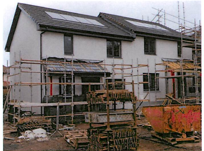
Corrie Crescent, Saltcoats

The Association was due to acquire this site from the developer in April 2020. However, due to the Covid-19 pandemic and lockdown this was delayed until June 2020.