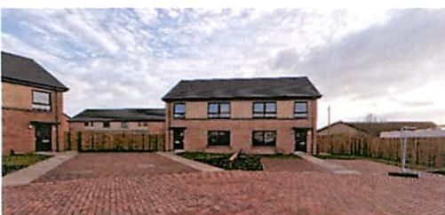
Ardoch Court, Stevenston

The total works costs of £3.86m was funded by £2.2m in Housing Association funding towards this project. The Association borrowed £1.6m of private finance.