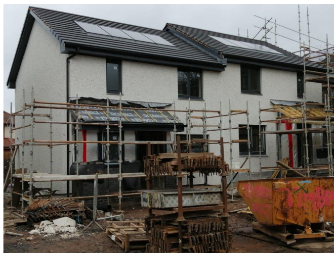
Corrie Crescent, Saltcoats

The Association was due to acquire this site from the developer in April 2020. However, due to the Covid-19 pandemic and lockdown this was delayed until June 2020.