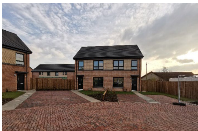
Ardoch Court, Stevenston

The total works costs of £3.86m was funded by £2.2m in Housing Association funding towards this project. The Association borrowed £1.6m of private finance.